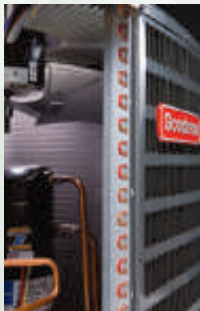
Goodman's SMARTCOIL™ 5mm tube condensing coil design optimizes the heat transfer ability of R-410A refrigerant compared to standard 3/8" copper tubing.

We know that the last thing you want to hear at night is a noisy air conditioner starting up. So, we build our Goodman brand GSX16 Air Conditioners with sound-dampening features that help ensure that your cooling system doesn't interfere with a good night's sleep. We rely on a quiet condenser fan system and a unique louvered sound-control top – to reduce fan-related noise. Your Goodman brand GSX16 Air Conditioner will keep your home cool and comfortable, year after year.