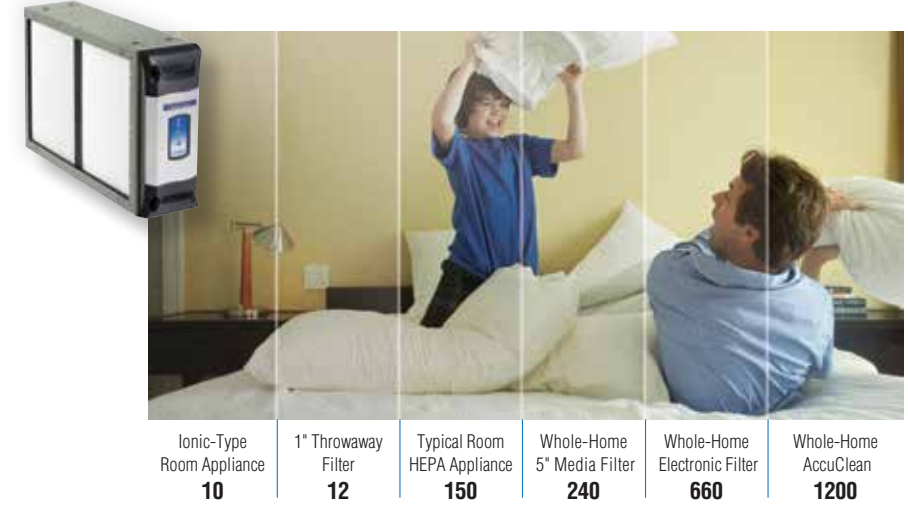
Ratings of cubic feet per minute of clean air delivered for a typical 3-ton heating and cooling system: the higher the value, the more effective the air cleaner.

Want 99.98% clean air? Then choose the home air filtration system that gives 110% - American Standard's revolutionary AccuClean™ By removing up to 99.98% of unwanted allergens down to .1 micron from the filtered air, AccuClean is 100 times more effective than a standard 1" throwaway filter. Simply put, AccuClean works harder, so you and your family can breath easier.