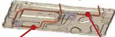
The base of Fujitsu's XLTH outdoor condensing units.

Other models may go as low as -5°F, however they do not include a base heater and other advancements found in XLTH models.