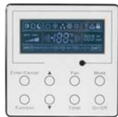
Wired controller included with Floor/Ceiling, Cassette, and Concealed units.