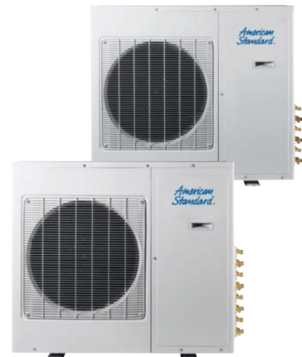
4TXM6 Multi-Zone Outdoor Units 2

Compressor stops or delays operation if conflicts arise.