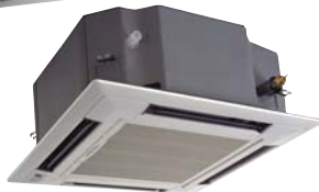
Cassette Indoor Unit 2