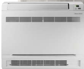
Console Multi-Zone Indoor Unit 3