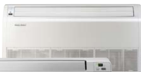
Floor/Ceiling Indoor Unit 2